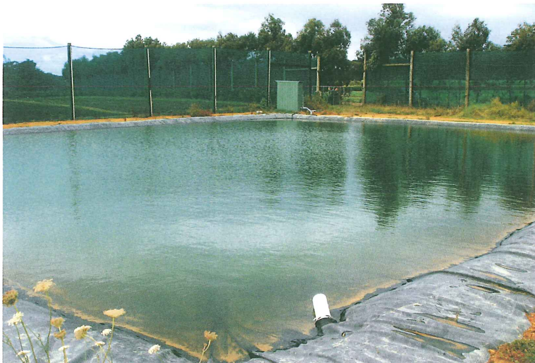
This pond at Kingflora covers 1080sq m